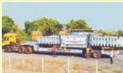
Samsung Engg. Co. Ltd. Burhanpur (M.P.) to Fouress Engg. India Ltd., Paithan (Maharashtra). Weight: 70 MT; Dimensions: 50' x 18.6' x 8'