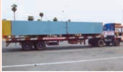
BHEL, Trichy (Tamilnadu) to TNEB, North Chennai (Tamilnadu). Weight: 56 MT; Dimensions: 44.3' x 12.3' x 9.8'