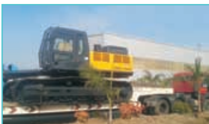
Hyundai Const. Equip.Pvt.Ltd., Chakan (Maharashtra) to International Commerce Ltd., Durgapur (W.B.). Weight: 52 MT; Dimensions: 40' x 12' x 14'