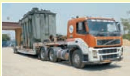
NTPC, Vindhyachal (U.P.) to BHEL, Jhansi (U.P.). Weight: 85 MT; Dimensions: 22' x 10' x 16'