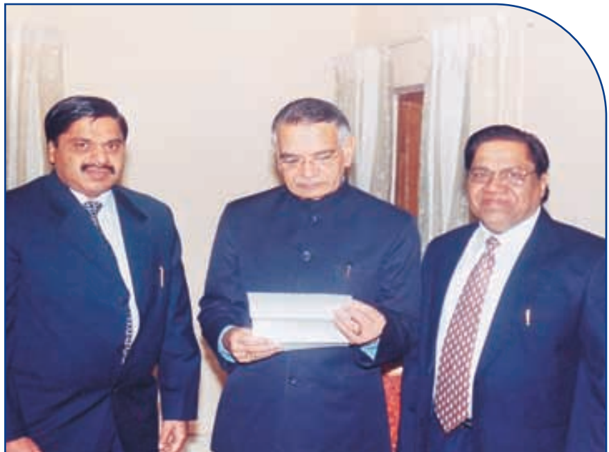
Donation of 51 lacs towards rehabilitation of Tsunami victims in the year 2005.