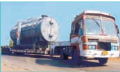
Shri Sairam Ind. Pvt. Ltd., Hyderabad (Telangana) to Vayunandana Power Ltd., Chandrapur (Maharashtra). Weight: 52 MT; Dimensions: 29' x 12'6" x 15'8"