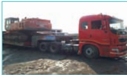
Sushree Infra Pvt. Ltd., Krishnashila (U.P.), to Bellampally (A.P.). Weight: 65 MT; Dimensions: 17'6" x 11' x 11'6"