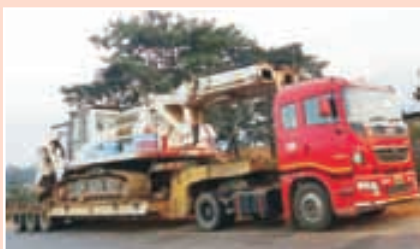
Siddhant Machinery Spares, Guwahati (Assam) to Simplex Infra. Ltd., Jiribum, (Imphal, Burma Border). Weight: 55 MT; Dimensions: 11.5' X 11.5' X 40'