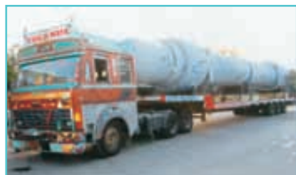
Hindustan Dorr Oliver Ltd., Vatwa (Gujarat) to BCPL, Lapatkata (Assam). Weight: 106 MT; Dimensions: 60' x 13' x 10'