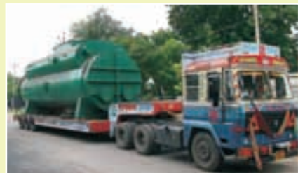
Siemens Ltd., Makarpura (Gujarat) to Essar Power Orissa Ltd., Paradeep (Orissa). Weight: 58 MT; Dimensions: 41' x 11' x 15'