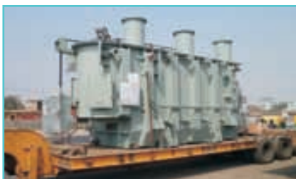
Transformer & Rectifiers India Ltd., Ahmedabad (Gujarat) to UPPTCL, Jhansi (U.P.). Weight: 62 MT; Dimensions: 24' x 8.2' x 13'