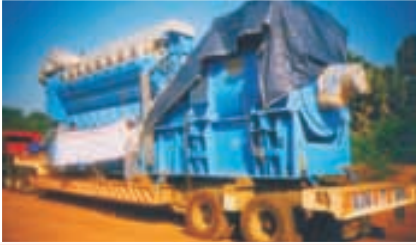
Penna Electricity Ltd., Madurai (Tamilnadu) to SRIBA Industries Ltd., Chigurukota (A.P.). Weight: 120 MT