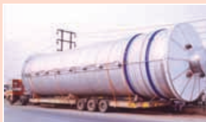
Chennai Harbour (Tamilnadu) to ITC Ltd., Badrachalam (Telangana). Weight: 40 MT; Dimensions: 54' x 14'1" x 16.4"