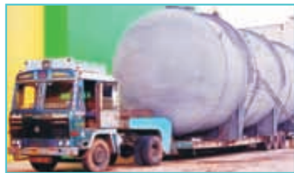
Patel Airtemp Limited, Santej (Gujarat) to M.R.P.L., Mangalore (Karnataka). Weight: 60 MT; Dimensions: 60' x 18'6" x 18'6"