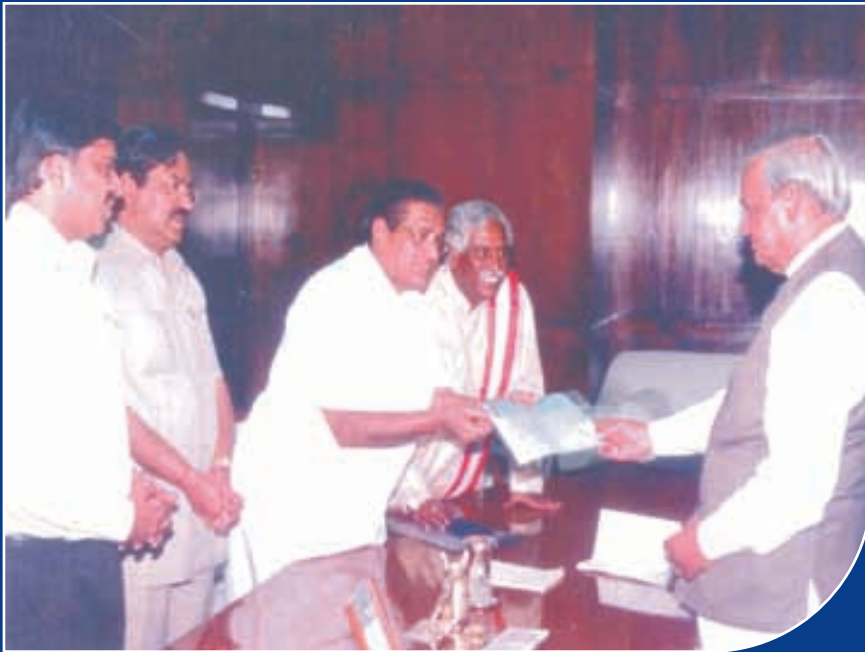
Donation of 40 lacs towards relief works for victims of Gujarat Earthquake in the year 2001.