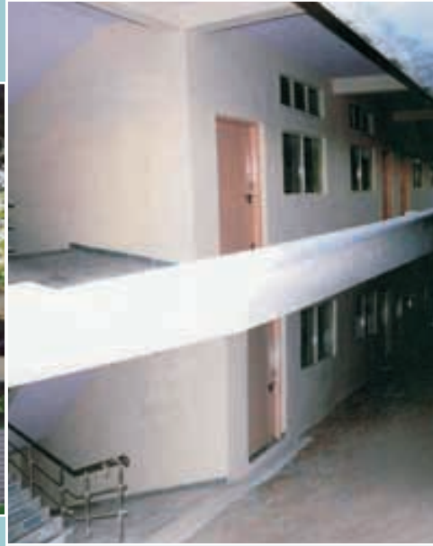
A R C EDUCATION BLOCK GOVT. JUNIOR GIRLS' COLLEGE, Khammam (Telangana)