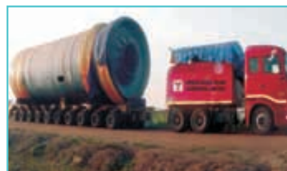
UltraTech Cement Limited, Nagpur. Weight: 110 MT Dimensions: 49.2' x 15' x 15'