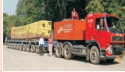
NTPC, Vindhyannagar (M.P.) to BHEL, Haridwar (Uttarakhand). Weight: 80 MT; Dimensions: 43' x 6' x 7'