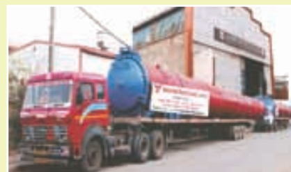
Laxmi En-Fab Pvt. Ltd., Vatva (Gujarat) to Dolphin Green Tech Ind., Biddargupe (Karnataka). Weight: 36 MT; Dimensions: 107' x 8'6" x 8'6"