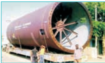
Alstom Projects India Ltd., Shahabad (Karnataka) to Essar Steel Orissa Ltd., Paradeep (Orissa). Weight: 62.5 MT; Dimensions: 41' x 14.7' x 14.7'