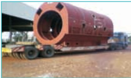
Simplex Casting Ltd., Durg (Chattisgarh) to BHEL, Hyderabad (Telangana). Weight: 62 MT; Dimensions: 26' x 15.5' x 18'