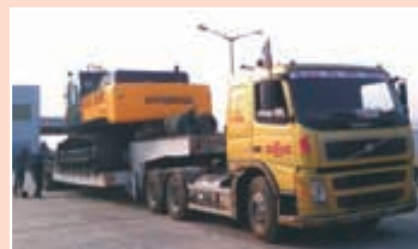
Hyundai Construction Equip., Chakan (Maharashtra) to International Commerce Ltd., Durgapur (W.B.). Weight: 52 MT; Dimensions: 40' x 11'6" x 13'6"