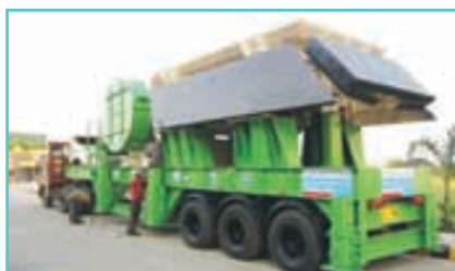
McNally Sayaji Engineering Limited, Manjusar (Gujarat) to Noida (U.P.). Weight: 63 MT; Dimensions: 40' x 10' x 16'