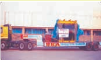
Penna Cement Industries, Pune (Maharashtra) to Kurnool (A.P.). Weight: 93 MT; Dimensions: 18' x 9' x 7.5'