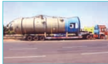
Alfa Laval Ltd., Pune (Maharashtra) to United Breweries Ltd., Bhiwadi (Rajasthan). Weight: 30 MT; Dimensions: 72' x 17.3" x 17.3"