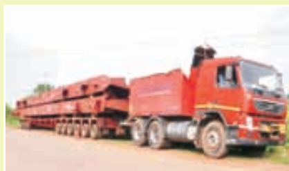
Atmascro Pvt. Ltd., Bilai (Chattisgarh) to Neyveli Lignite Corporation Ltd., Neyveli (Tamilnadu). Weight: 117 MT; Dimensions: 105' x 14' x 8'