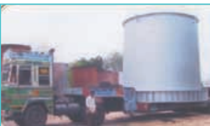
Genset Engineers, Kondapally (A.P.) to Tenova Hypertherm Pvt. Ltd., Vasai (Maharashtra). Weight: 66 MT; Dimensions: 20'1" x 20'1" x 16'5"